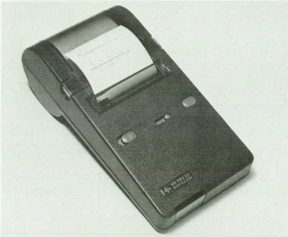
Fig. 1. The HP 82240A Infrared Printer is a battery-operated printer designed for use with the HP-18C and HP-28C Calculators. The need for connecting cables is eliminated by using an infrared beam for data transmission.

The HP 82240A measures approximately 7.25 inches long by 3.5 inches wide by 2.5 inches tall. It weighs about